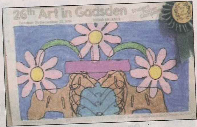
Tyler Carroll's Best of Show student poster.

background in classical mythology, gender studies, and critical theory to reimagine